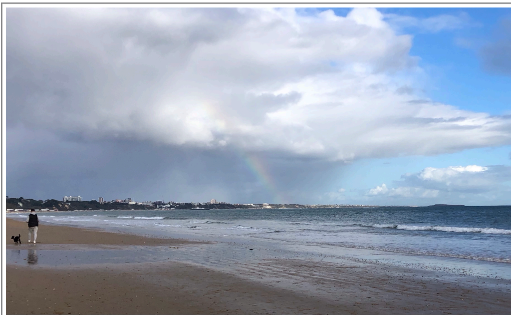
November rainbow over Poole Bay