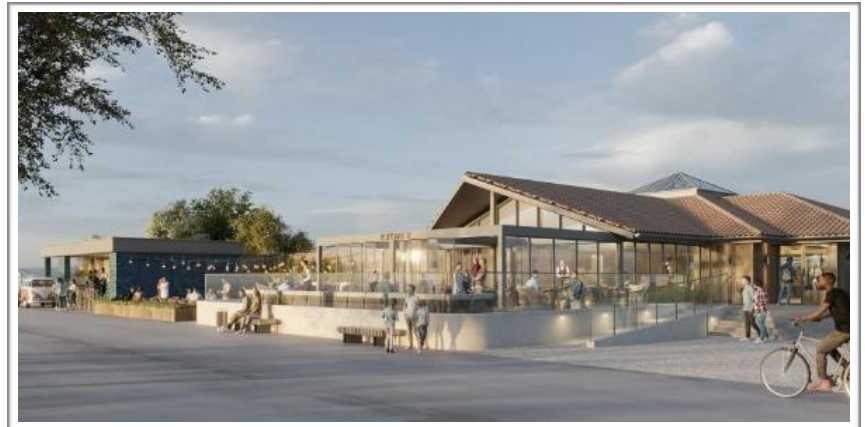
CGI image of the new proposed restaurant