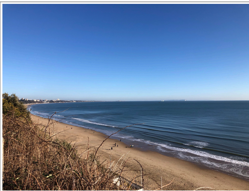
Peaceful bay view from Canford Cliffs in January