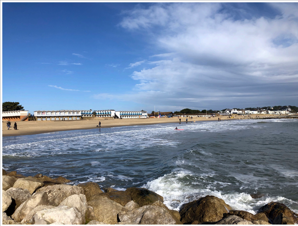
Sandbanks from the rock groyne