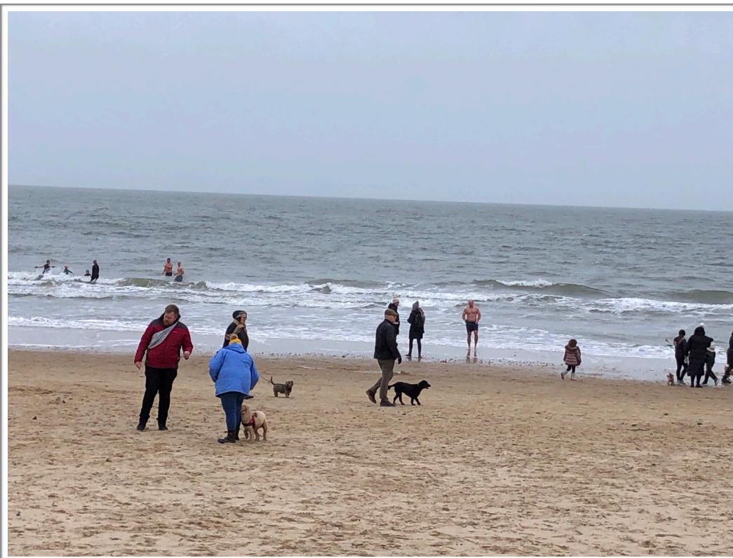
Hardy New Year dippers and walkers